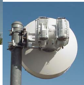
Typical 1+1 ODU deployment ▶