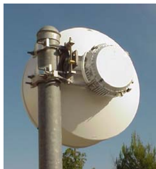
◀ Typical 1+0 ODU deployment

Microwave radio is an established technology used by telecommunication operators and organizations where quality of service is ensured through careful frequency and link planning. CableFree Microwave Radios are distinguished by high performance, advanced radio features and flexible reconfigurable network interfaces.